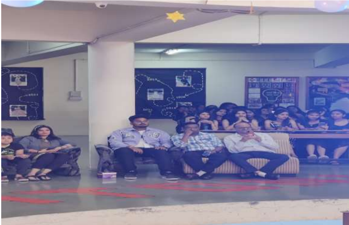
Celebration for Party

ASSOCIATION OF COMPUTER ENGINEERING STUDENTS