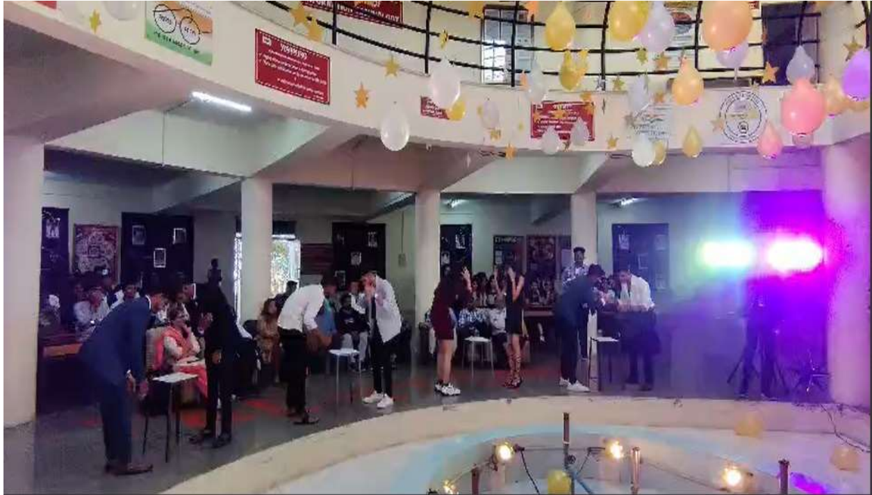
Head shoulder Toe game

ASSOCIATION OF COMPUTER ENGINEERING STUDENTS