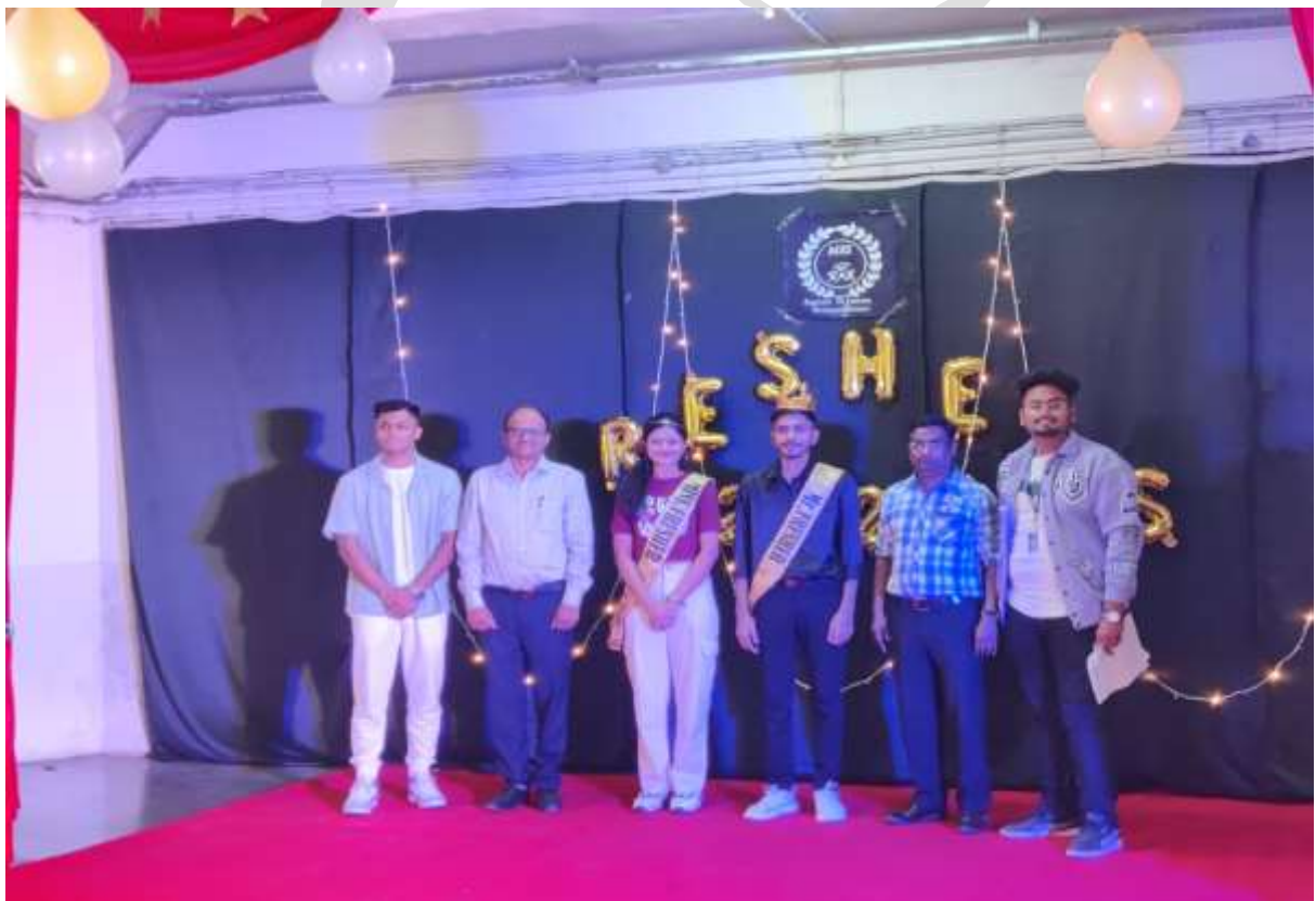
Mr & Miss Fresher 2023-24