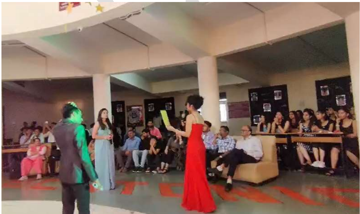
Guess the World game