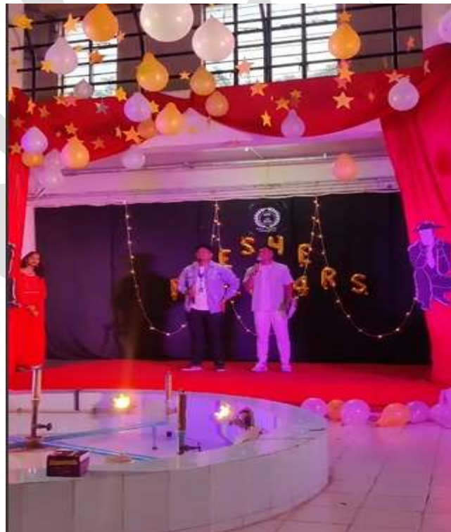
ACES President & Vice President addressing the freshers