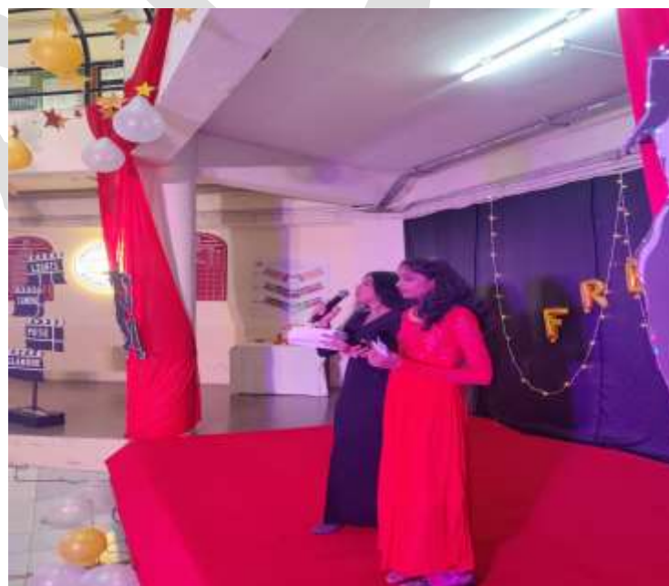
Anchor for Fresher party