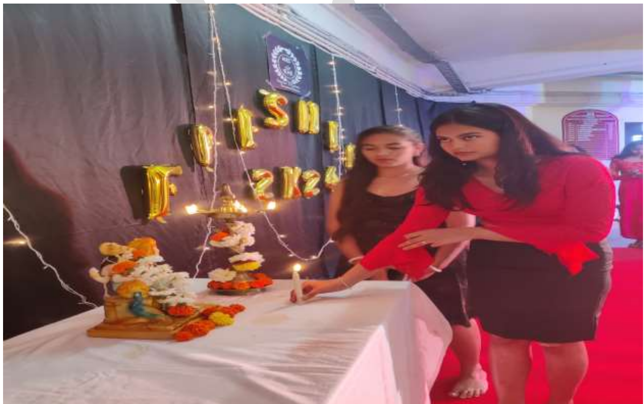
Saraswati Pujan by Girls students