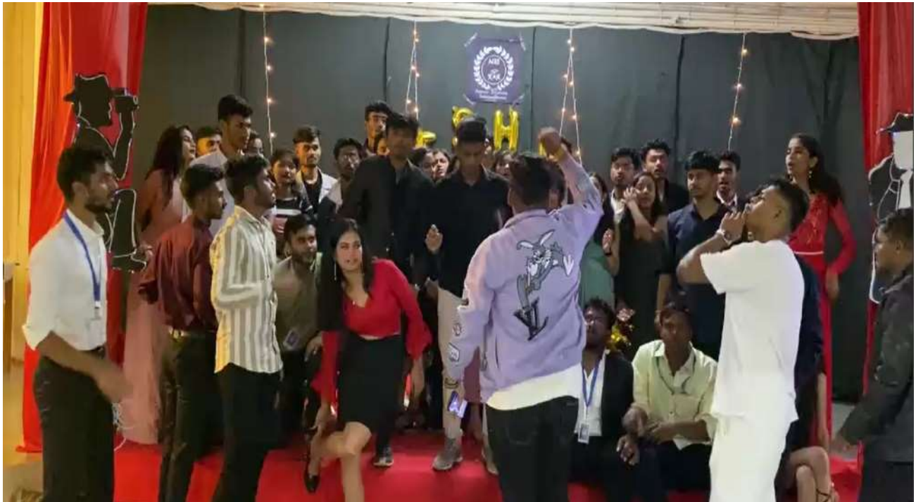
Fresher students Gathering for party

ASSOCIATION OF COMPUTER ENGINEERING STUDENTS