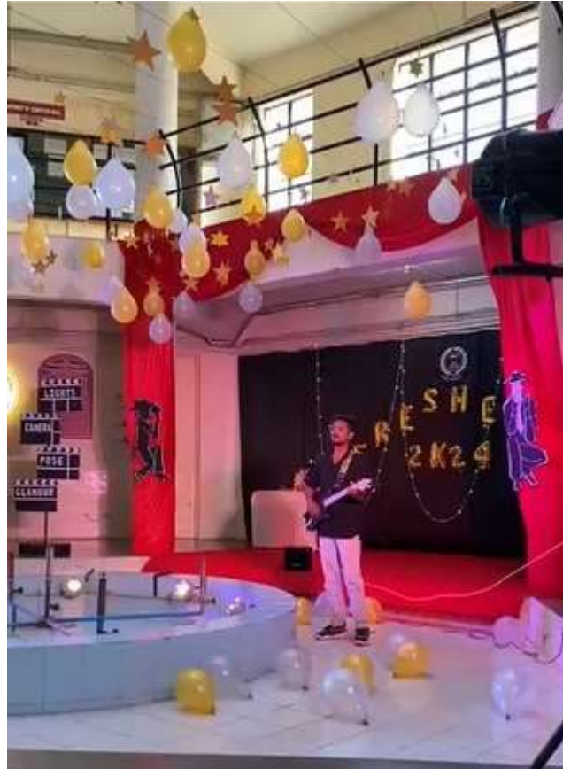
Singing Performance by student

ASSOCIATION OF COMPUTER ENGINEERING STUDENTS